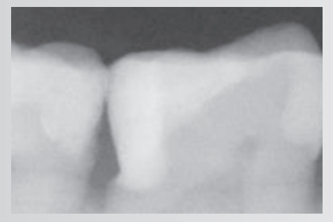
A. Radiograph prior to treatment.